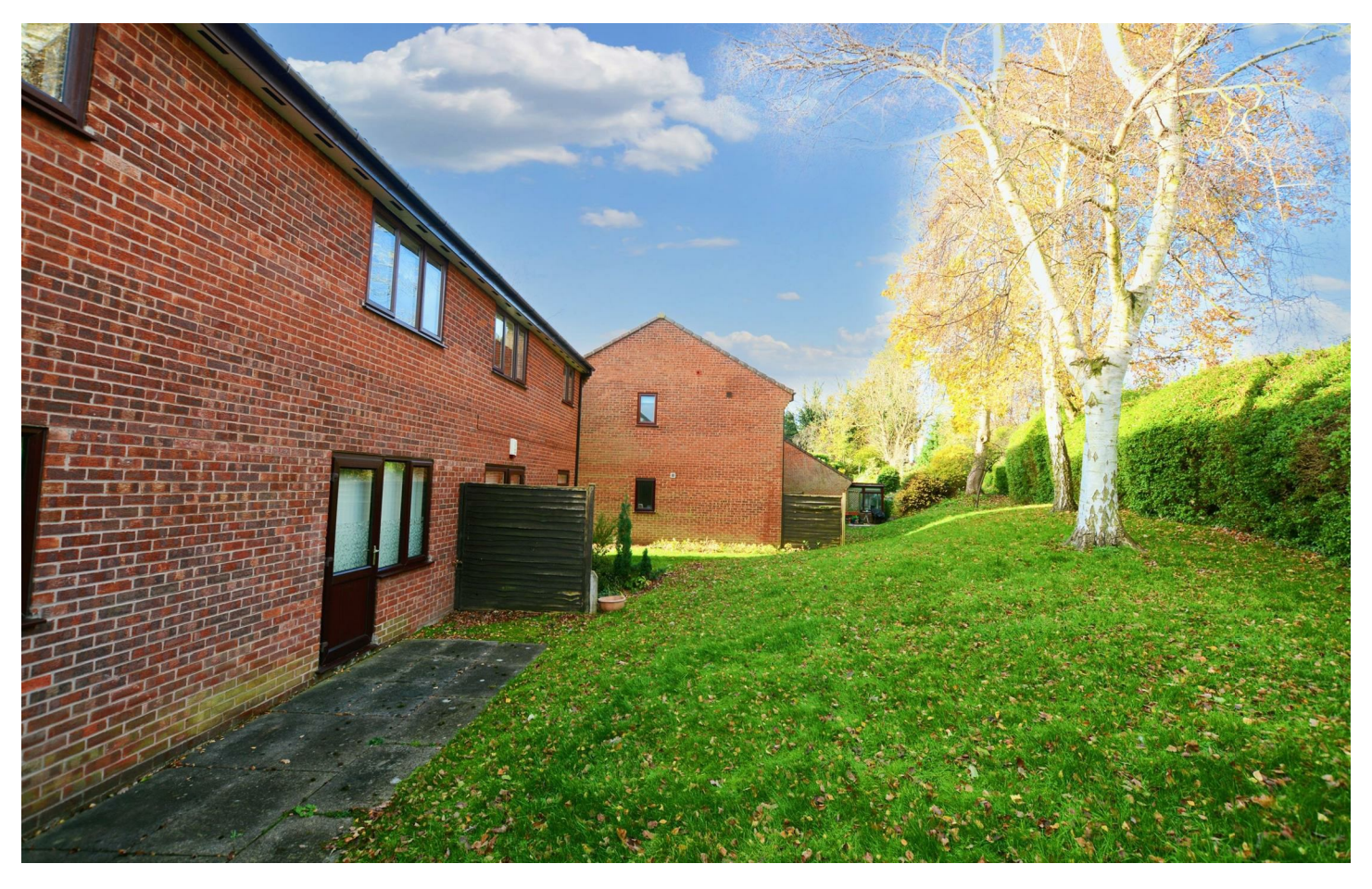
** INDEPENDENT LIVING FOR OVER 60'S **

Robert Ellis Estate agents are proud to bring to the market this fantastic TWO DOUBLE BEDROOM, TOP FLOOR MAISONETTE situated in Sherwood, Nottingham.