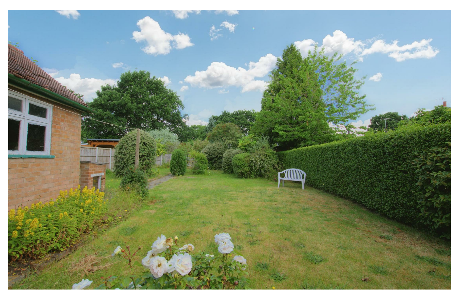
*** GENEROUS PLOT, POTENTIAL TO IMPROVE AND DEVELOP***

Robert Ellis Estate Agents are delighted to bring to the market this EXTENDED FOUR BEDROOM, DETACHED FAMILY PROPERTY SITUATED ON A GENEROUS PLOT WITHIN REDHILL, NOTTINGHAM.