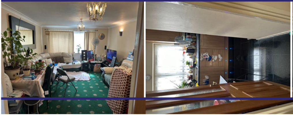
GROUND FLOOR 872 sq.ft. (81.0 sq.m.) approx.