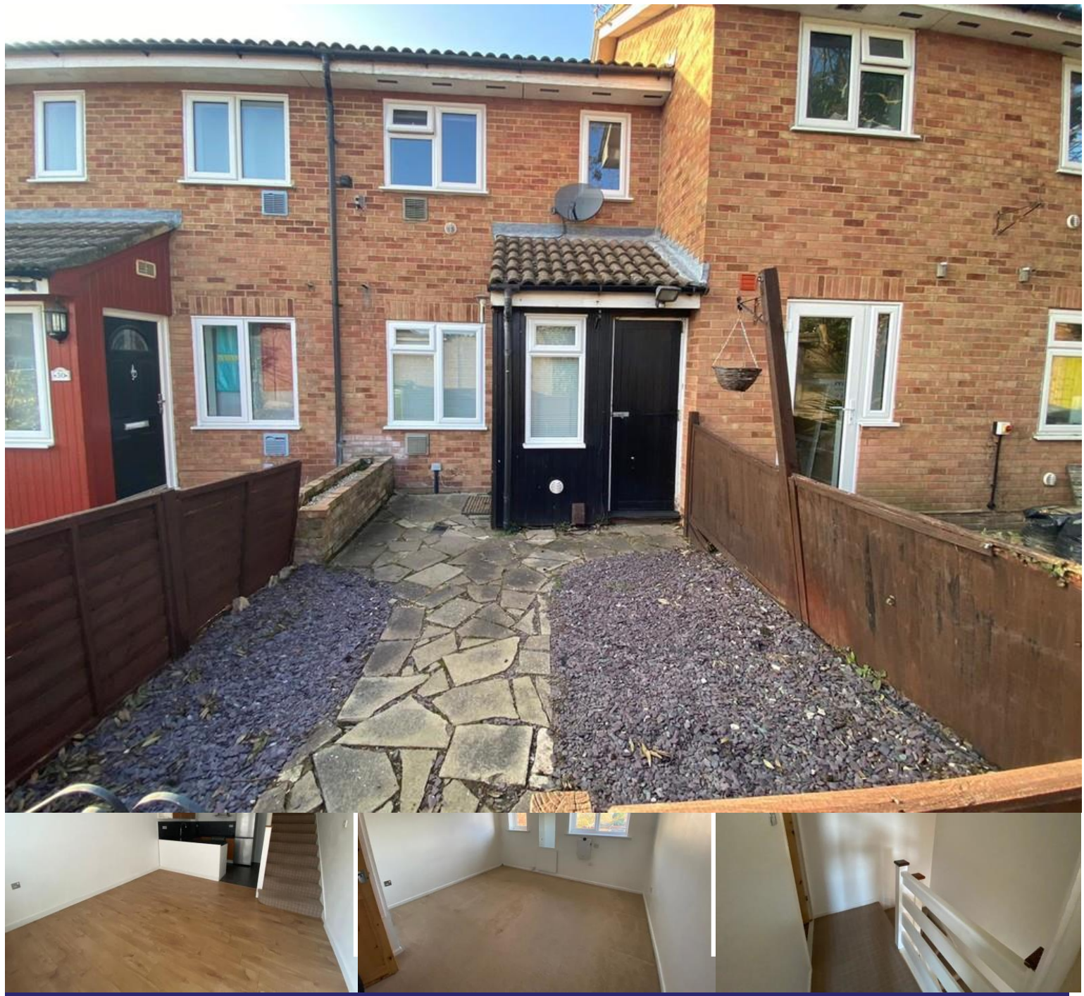
Shellfield Close | Staines-upon-Thames | TW19 6BX