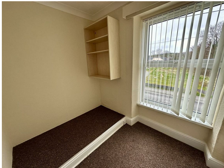
Office / Box Room 8'3" x 6'3" (2.51m x 1.91m)

with wash hand basin, built in wardrobes/storage, radiator