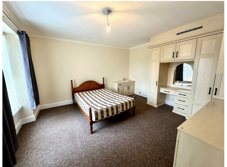
Principle Bedroom 14' x 13'2" (4.27m x 4.01m)

with wash hand basin, built in wardrobes/storage, radiator