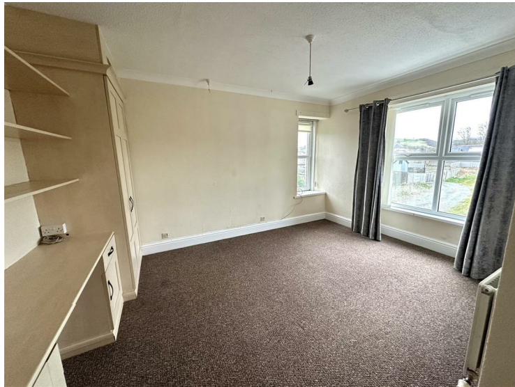
Front Double Bedroom 14'2" x 11'6" (4.32m x 3.51m)

with radiator & built in wardrobes / shelving.