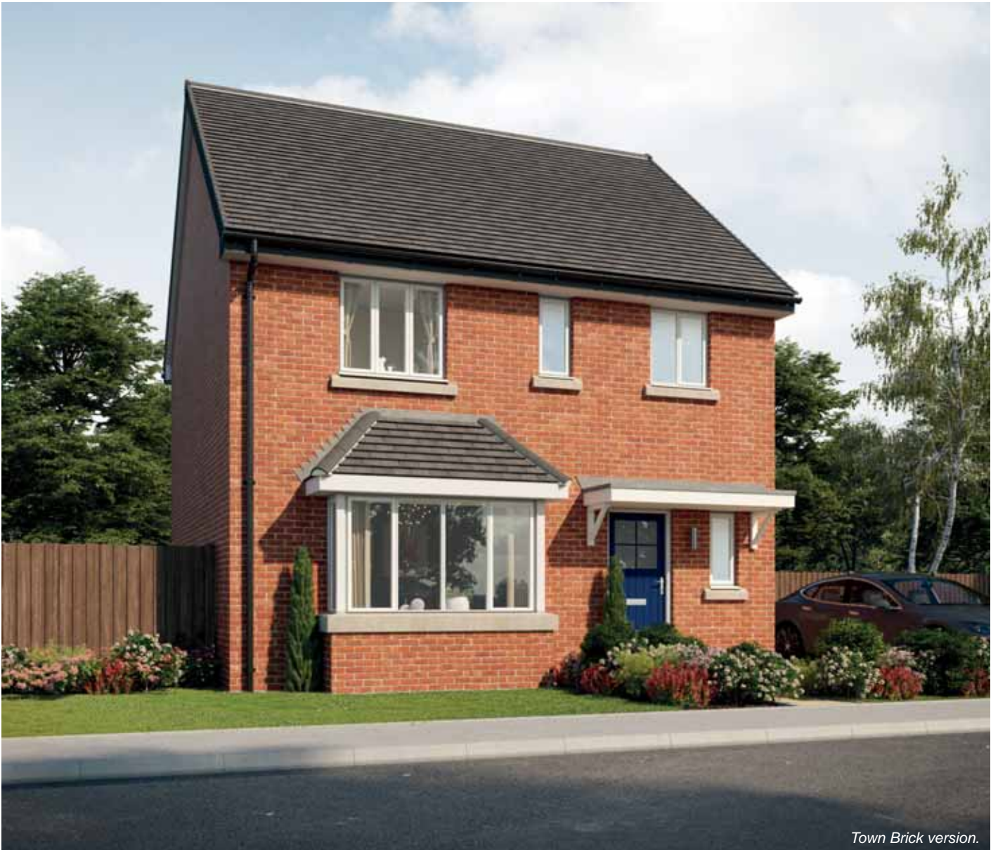
Town Brick version.