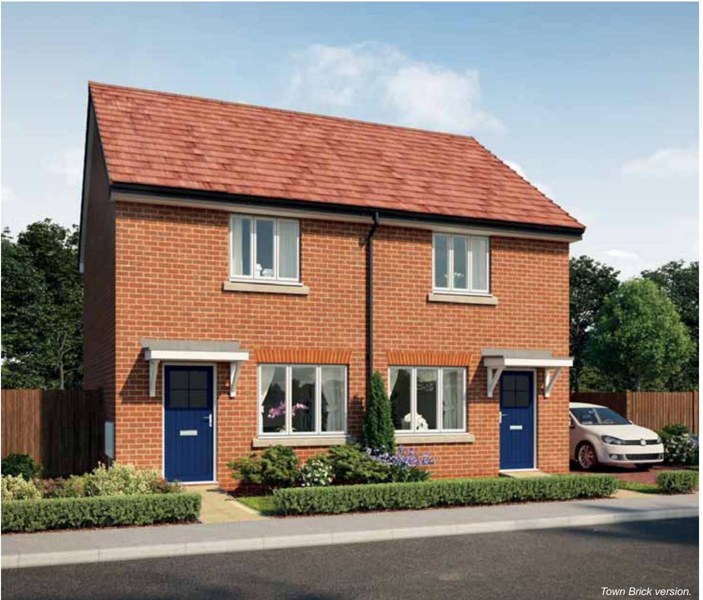
Town Brick version.