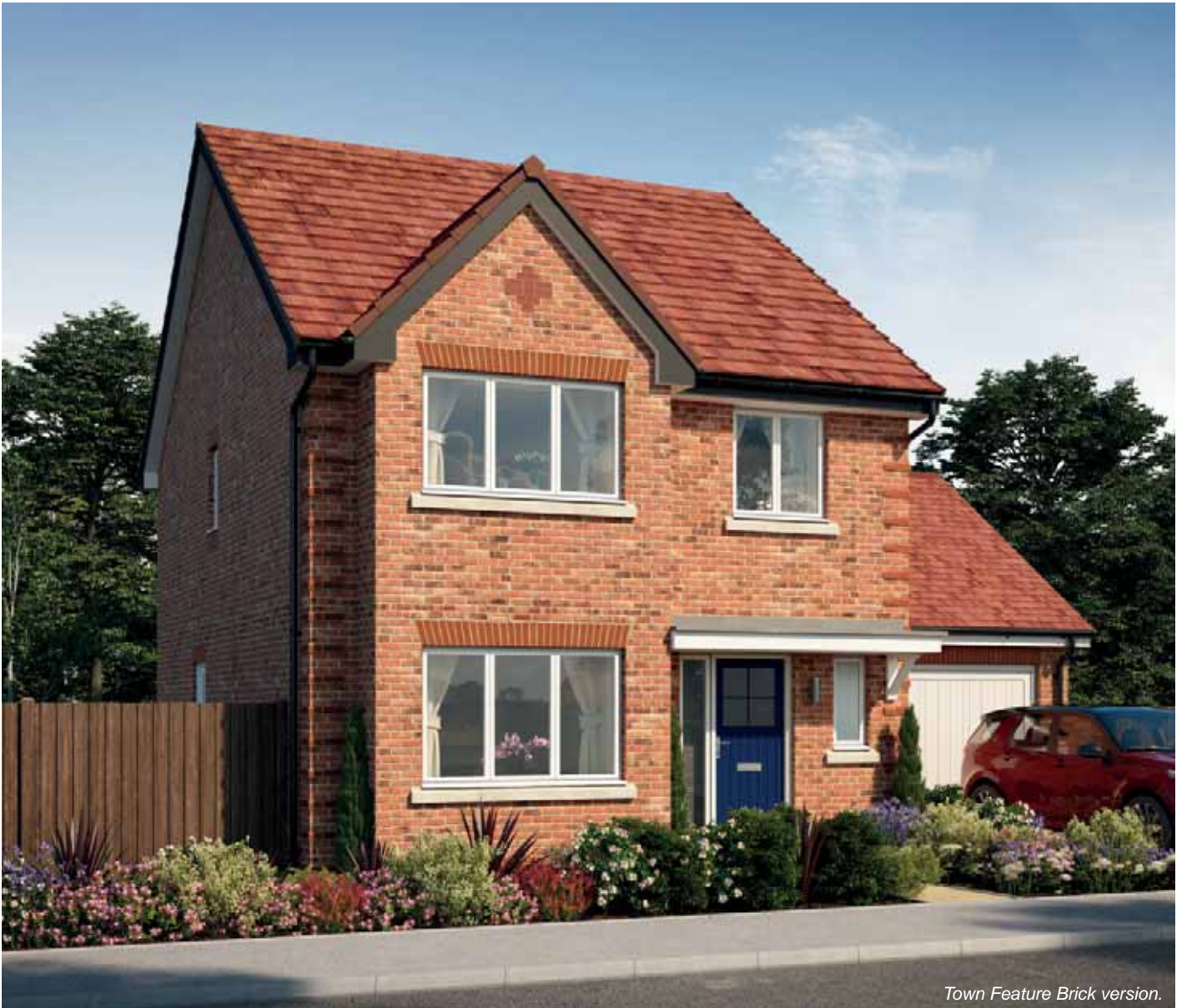
Town Feature Brick version.