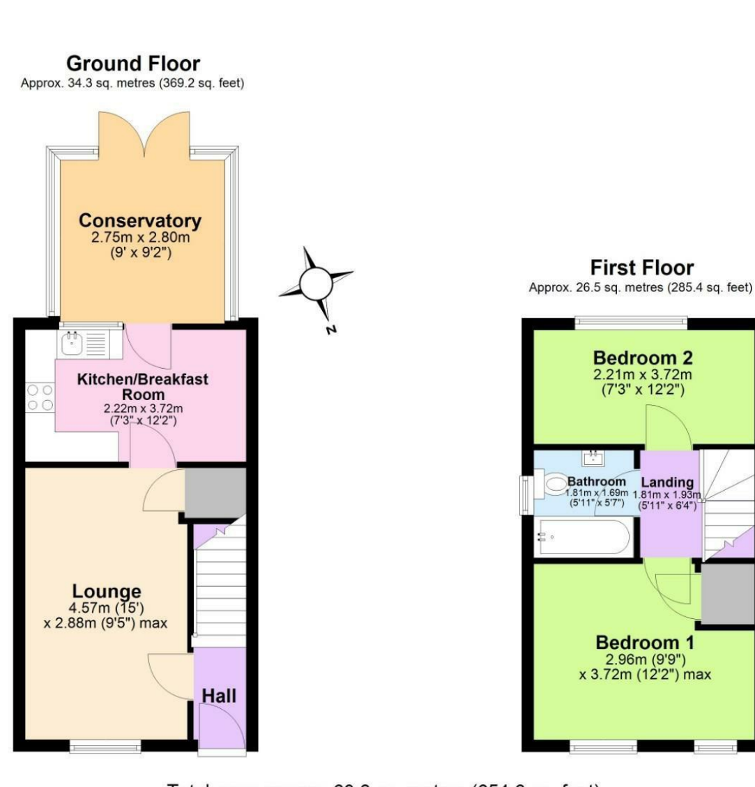
Total area: approx. 60.8 sq. metres (654.6 sq. feet)