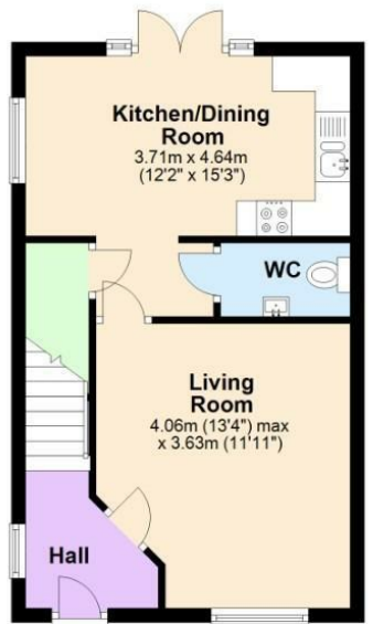
Main area: Approx. 73.1 sq. metres (786.4 sq. feet) Plus garages, approx. 15.3 sq. metres (164.8 sq. feet)