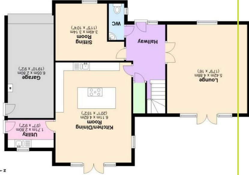
Approx. 100.2 sq. metres (1326 sq. feet)