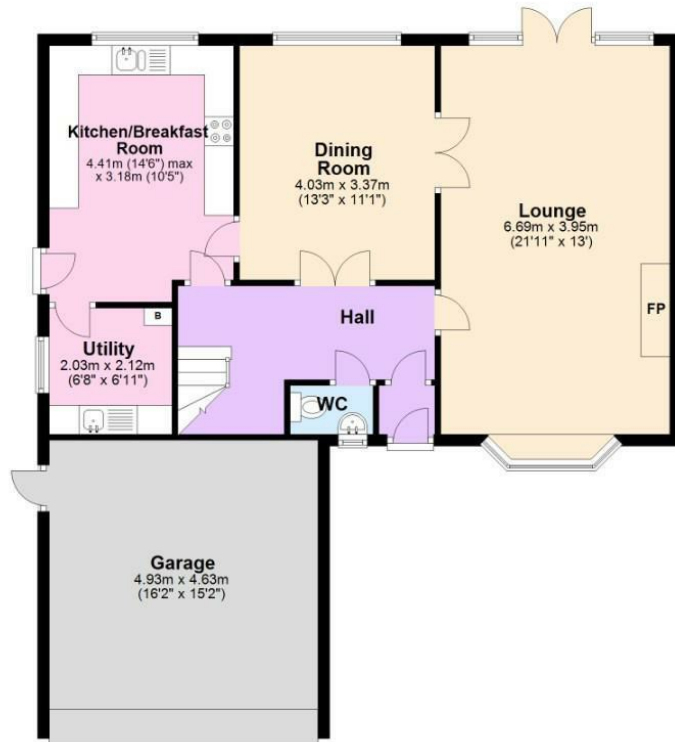
Ground Floor Approx. 94.9 sq. metres (1021.4 sq. feet)