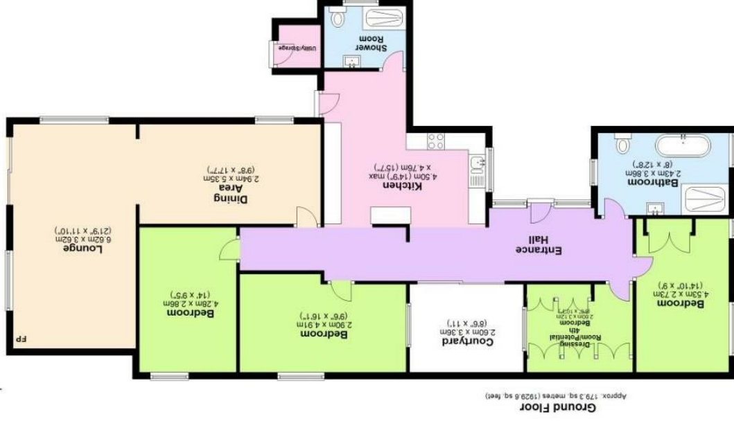
Ground floor Approx. 179.3 sq. metres (1929.6 sq. feet)

Total area: approx. 179.3 sq. metres (1929.6 sq. feet)