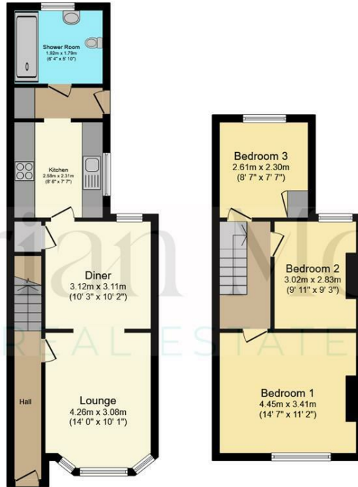
Ground Floor Floor area 44.1 m 2 (474 sq.ft.) First Floor Floor area 34.2 m 2 (368 sq.ft.)