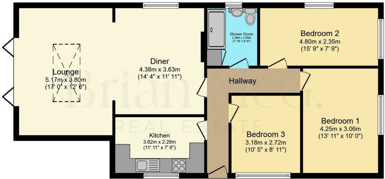
Floor Plan Floor area 91.6 sq.m. (986 sq.ft.)

Total floor area: 91.6 sq.m. (986 sq.ft.)