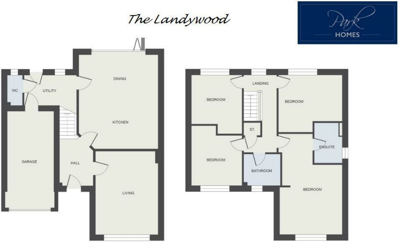
Plots 1 & 4 - Total Sq Ft: 1863

This floor plan is for illustrative purposes only. It is not drawn to scale. Any measurements, floor areas (including any total floor area), openings and orientation are approximate. No details are guaranteed, they cannot be relied upon for any purpose and they do not form part of any agreement. No liability is taken for any error, omission or misstatement. A party must rely upon its own inspection(s).