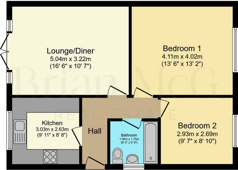
Floor Plan Floor area 57.0 sq.m. (614 sq.ft.)

Total floor area: 57.0 sq.m. (614 sq.ft.)