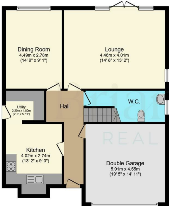
Ground Floor Floor area 95.9 sq.m. (1,032 sq.ft.)