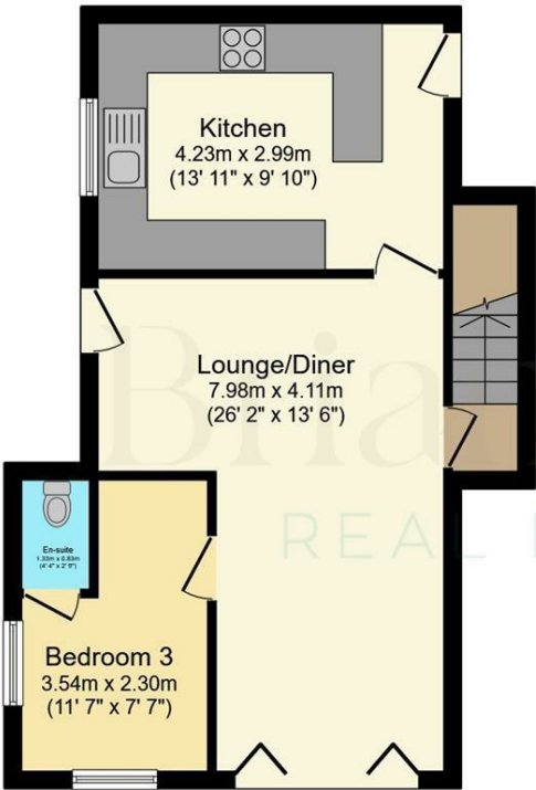
Ground Floor Floor area 44.4 m 2 (478 sq.ft.)