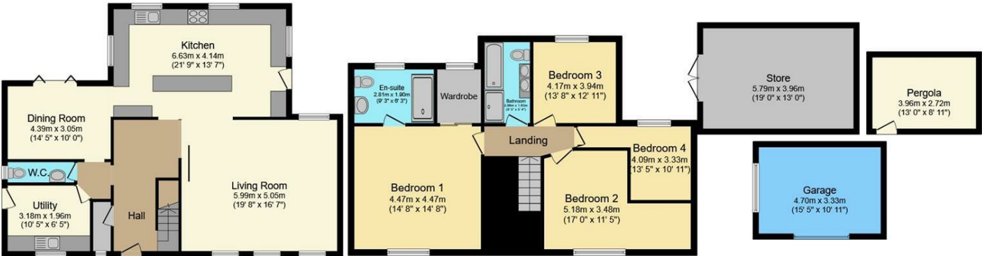
Ground Floor Floor area 97.3 sq.m. (1,047 sq.ft.)