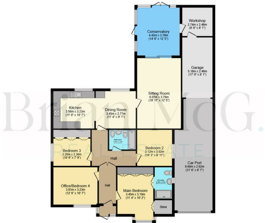
Floor Plan Floor area 158.6 m 2 (1,707 sq.ft.)