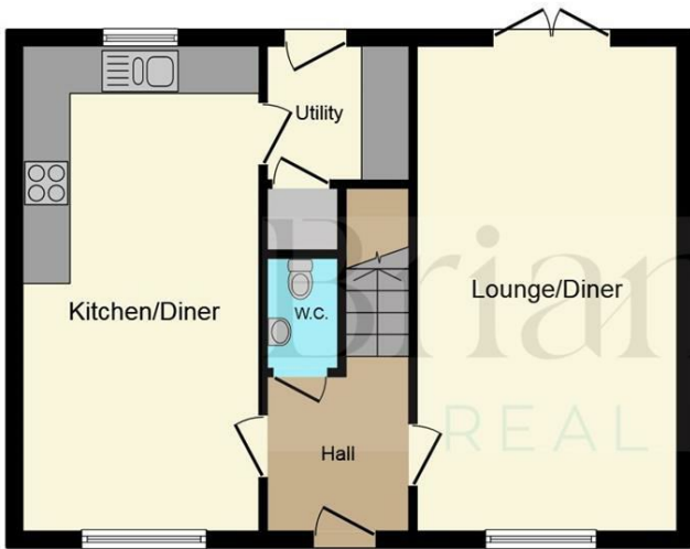
Ground Floor Floor area 51.0 sq.m. (549 sq.ft.)