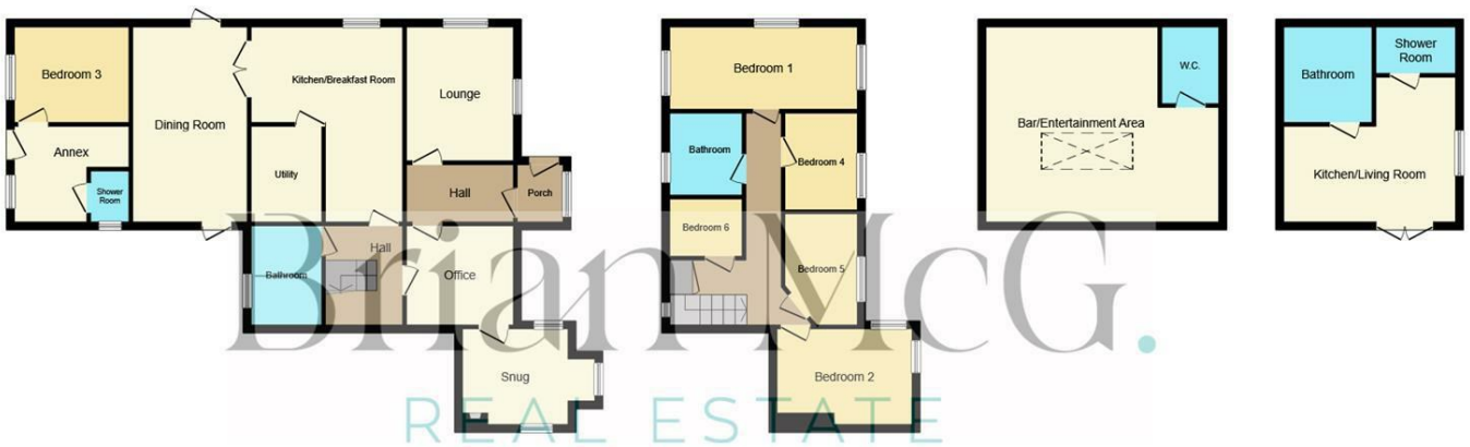
Ground Floor Floor area 95.0 m 2 (1,022 sq.ft.)