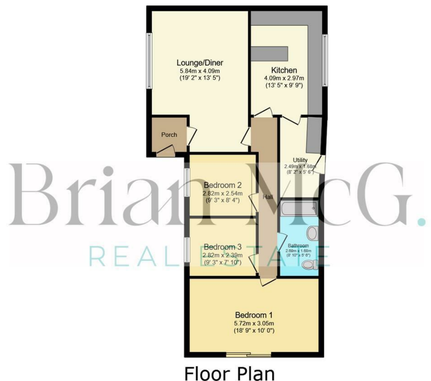
Floor area 85.6 m<sup>2</sup> (921 sq.ft.)