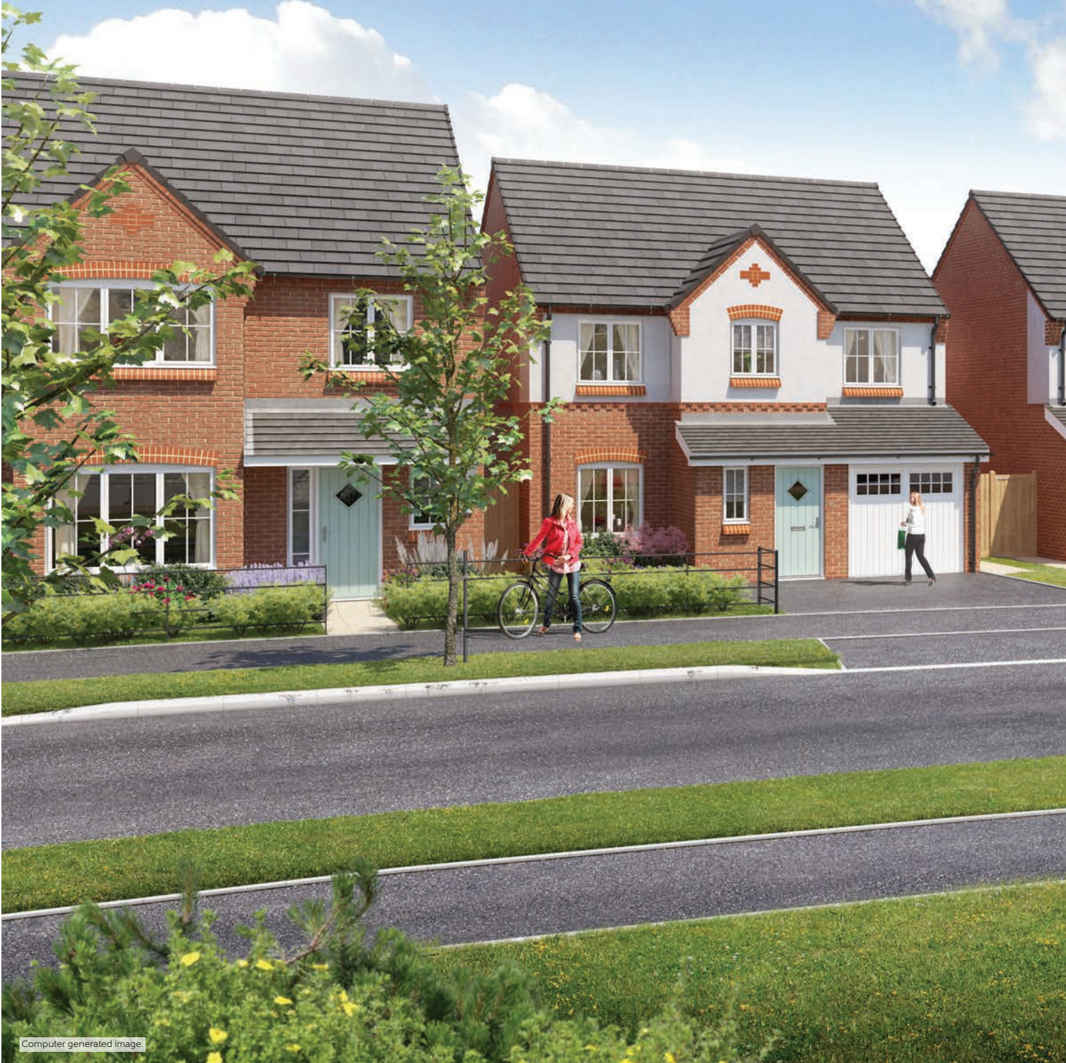
Computer generated image.