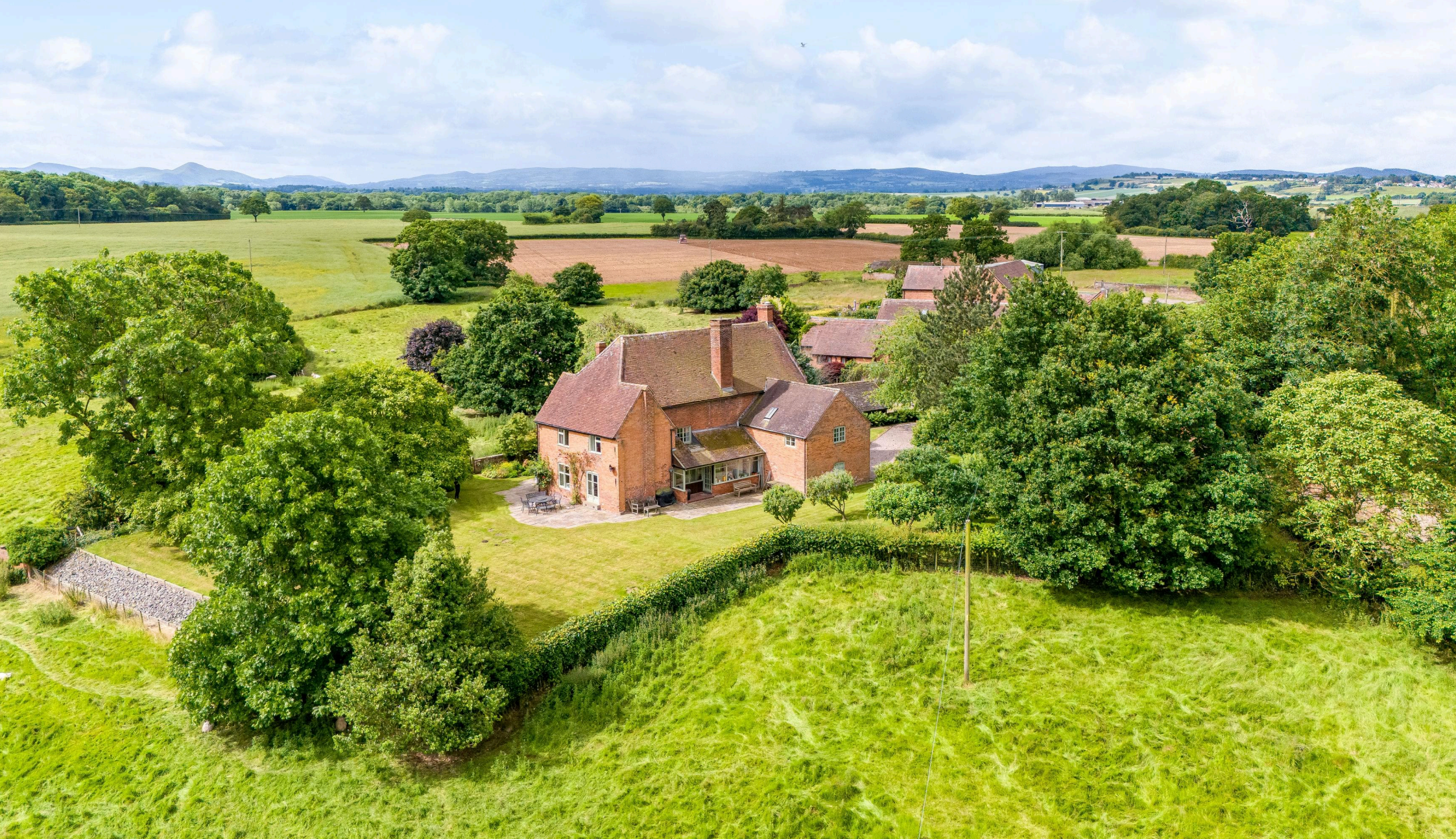
Betton Grange, Cross Houses, Shrewsbury SY5