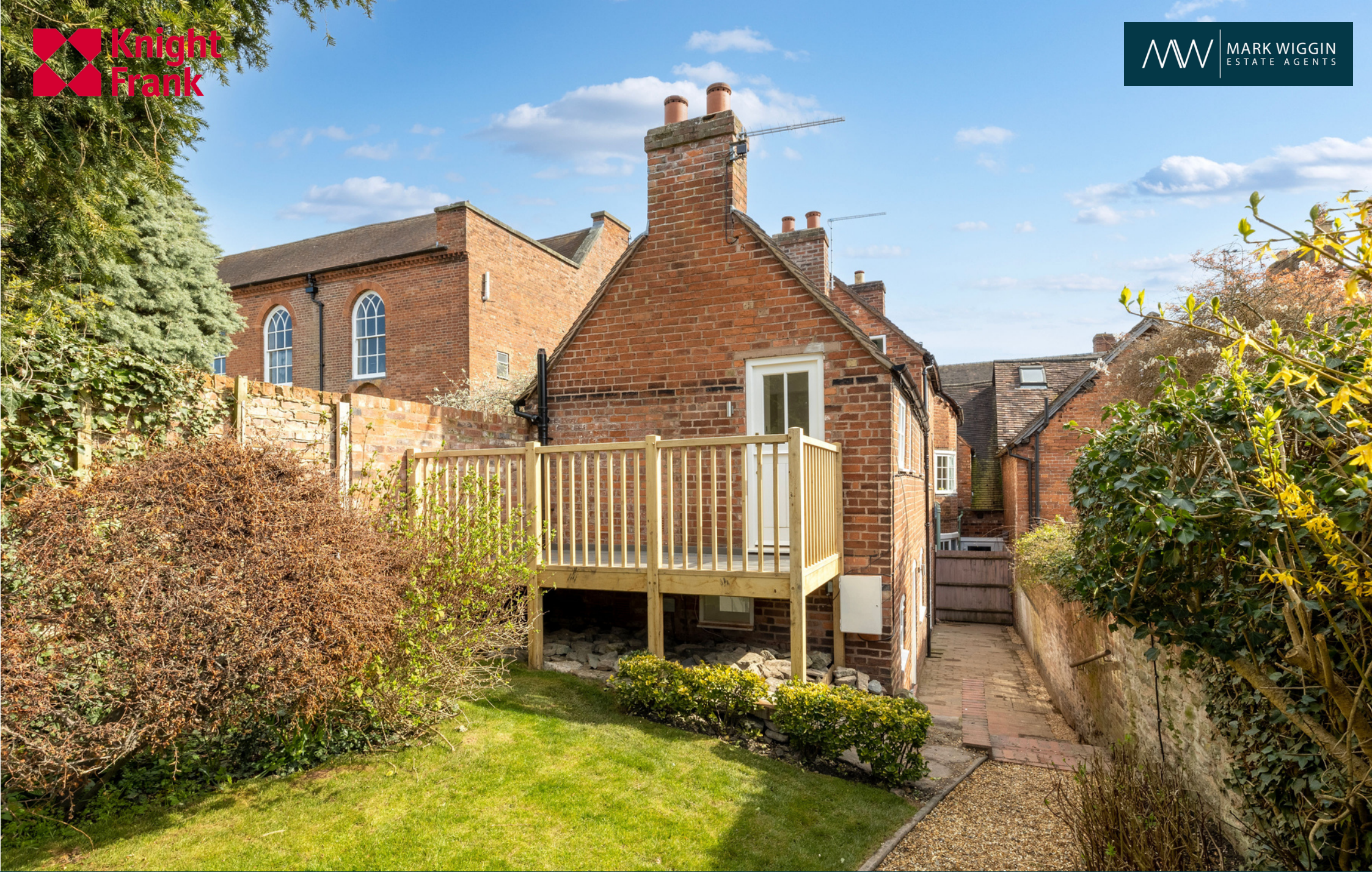
Flower Cottage Dinham Hall, Ludlow, Shropshire, SY8 1EJ