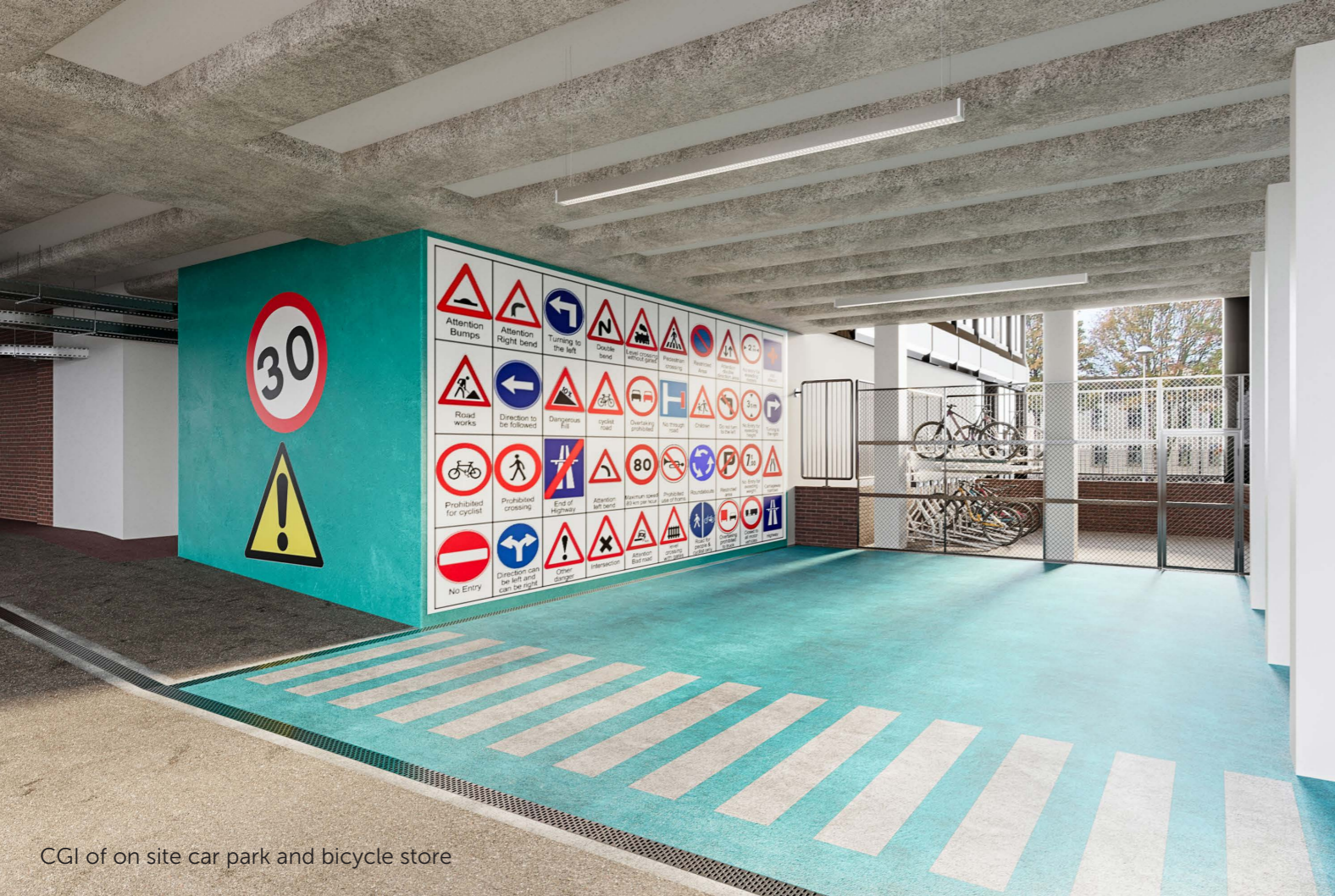
CGI of on site car park and bicycle store

Generous new End of Journey facilities are to be constructed in the undercroft of the building. This provides new showers, lockers, drying room and secure cycle storage, connecting directly into the building core and lifts to all floors.