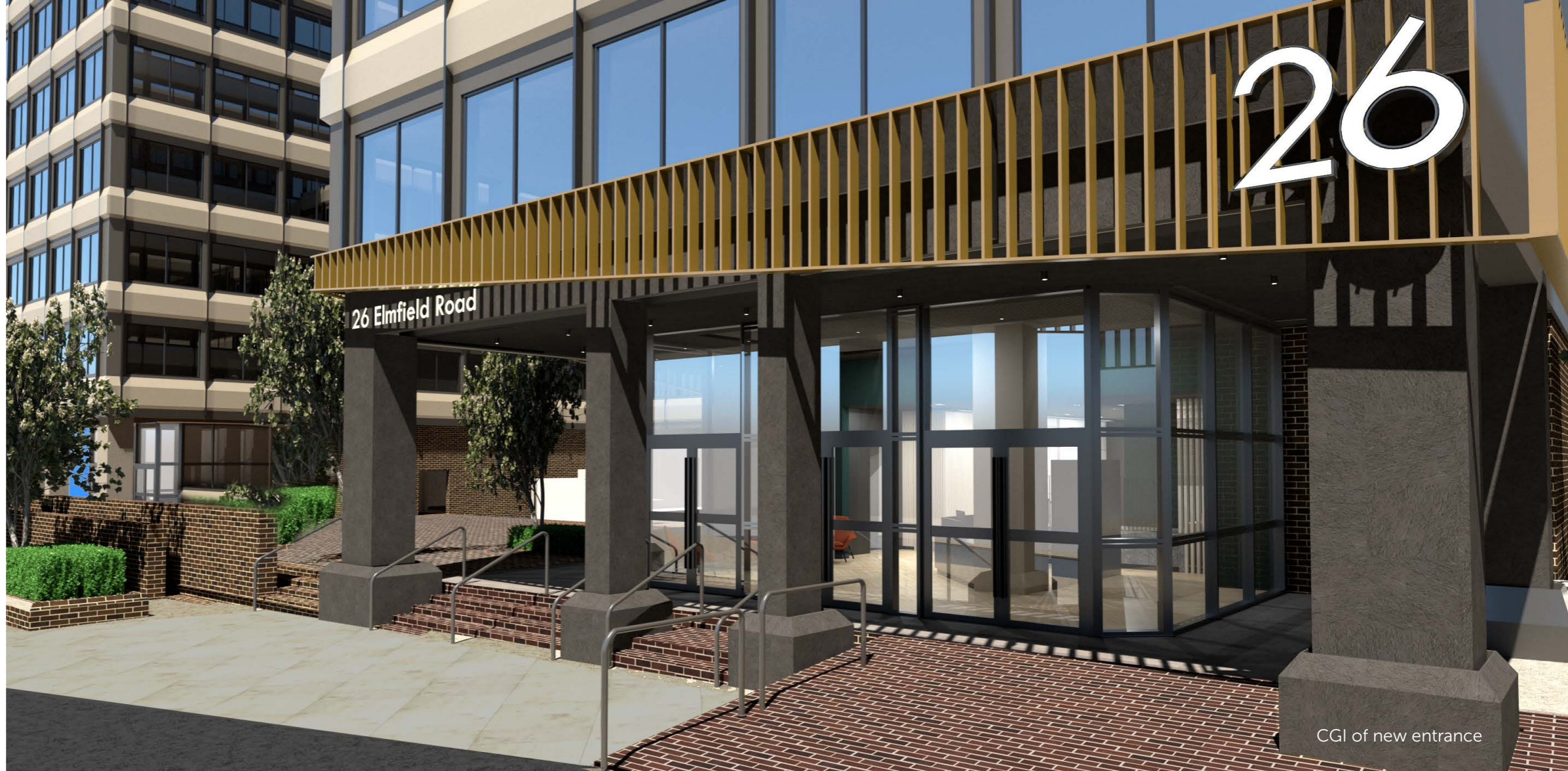
CGI of new entrance