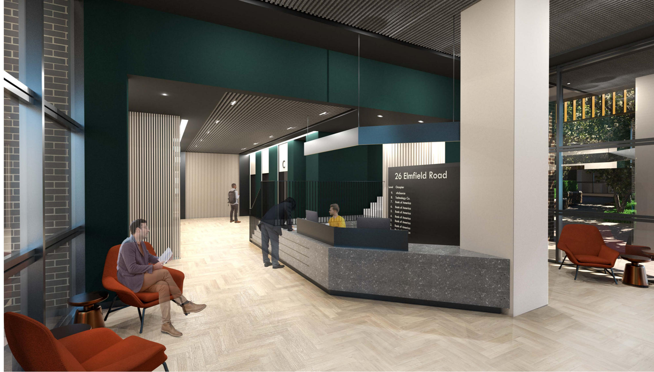
CGIs of new reception area