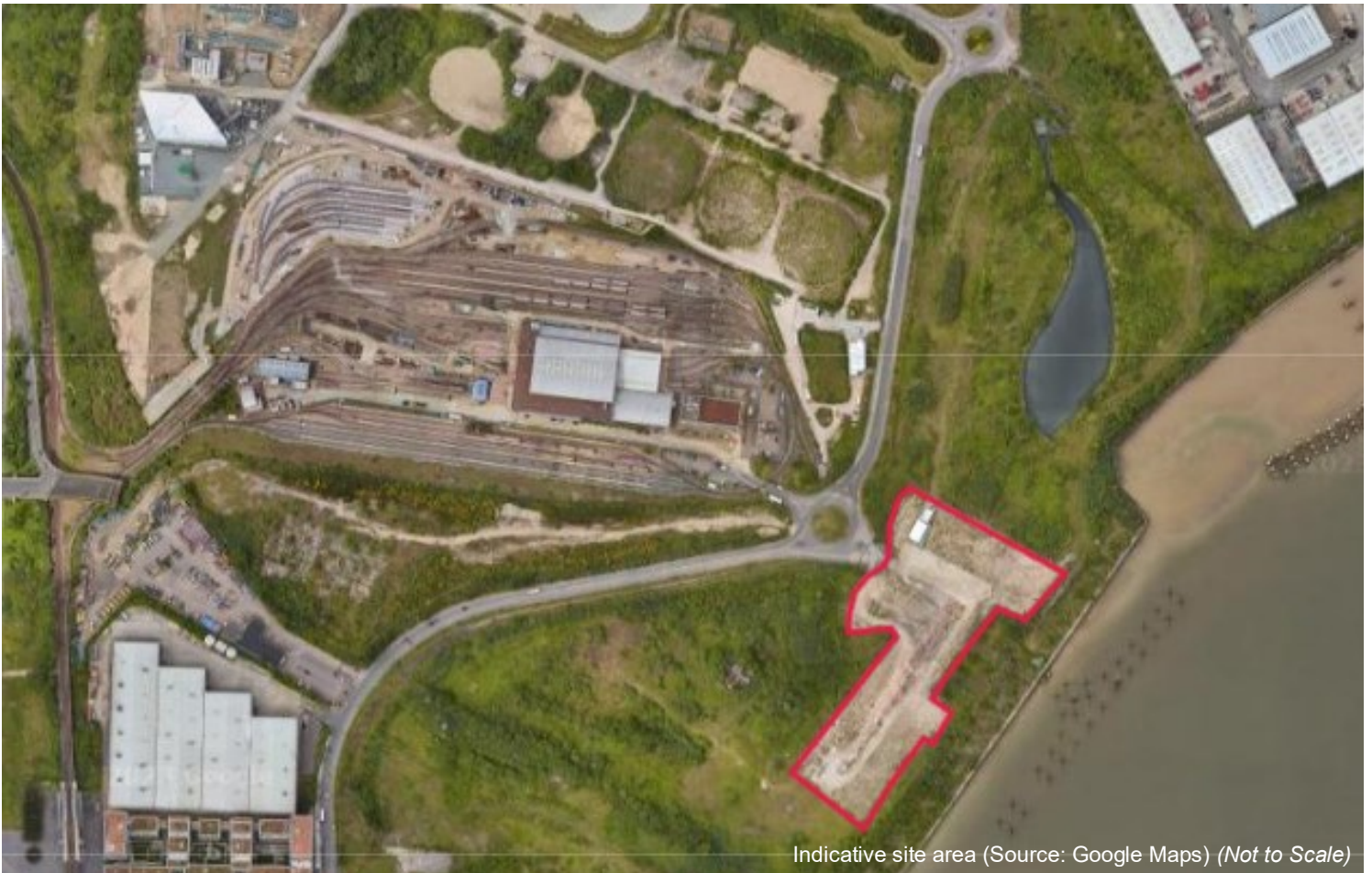
Indicative site area (Not to Scale)