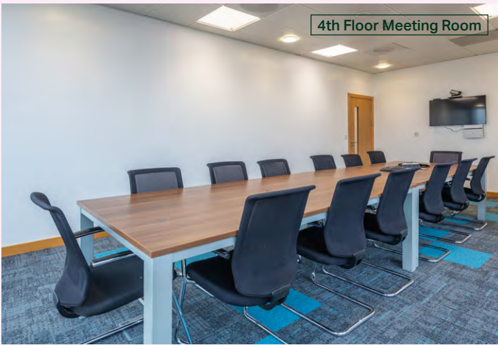
4th Floor Meeting Room