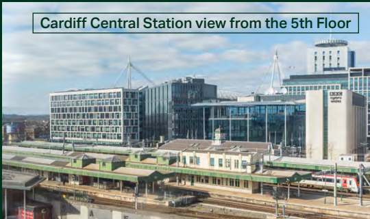
Cardiff Central Station view from the 5th Floor

Cardiff has its own international airport located 19.2 Km (12 miles) from the city centre.