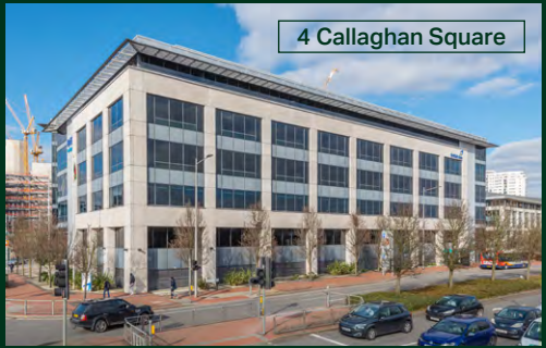
4 Callaghan Square