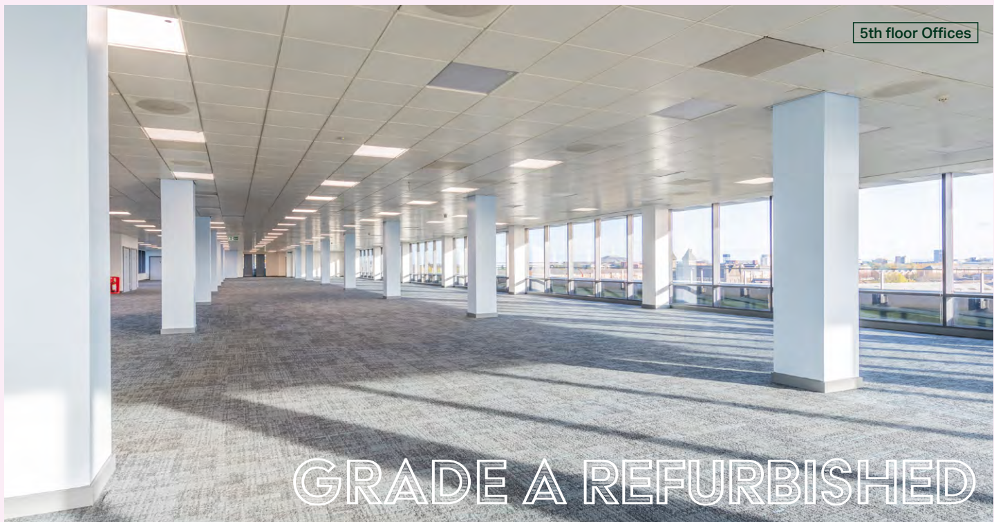
5th floor Offices