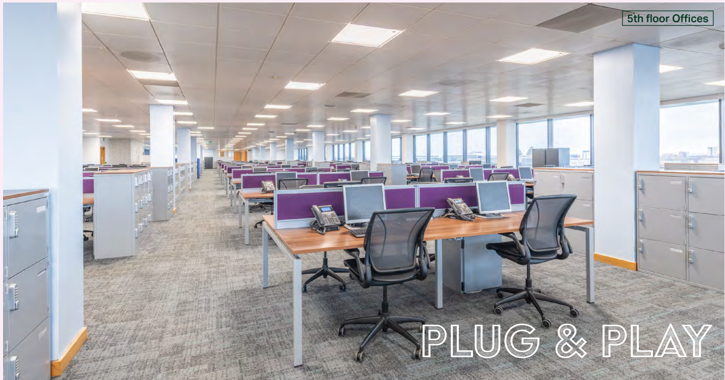
5th floor Offices