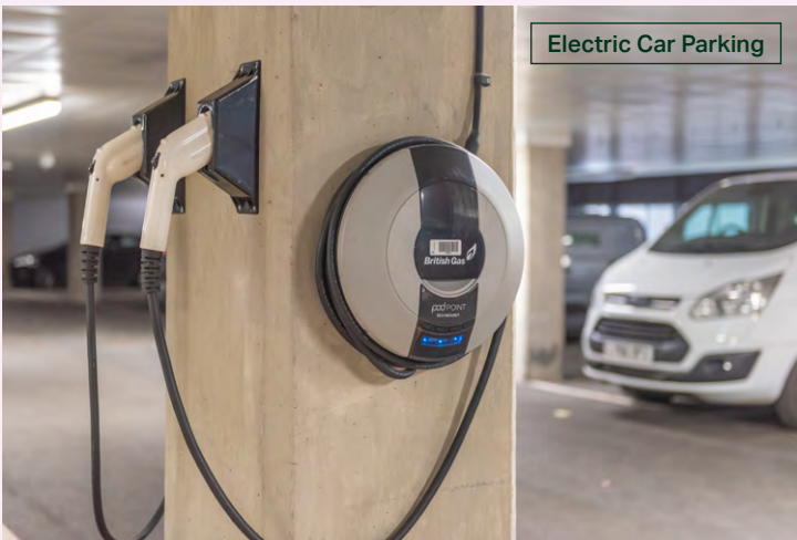
Electric Car Parking