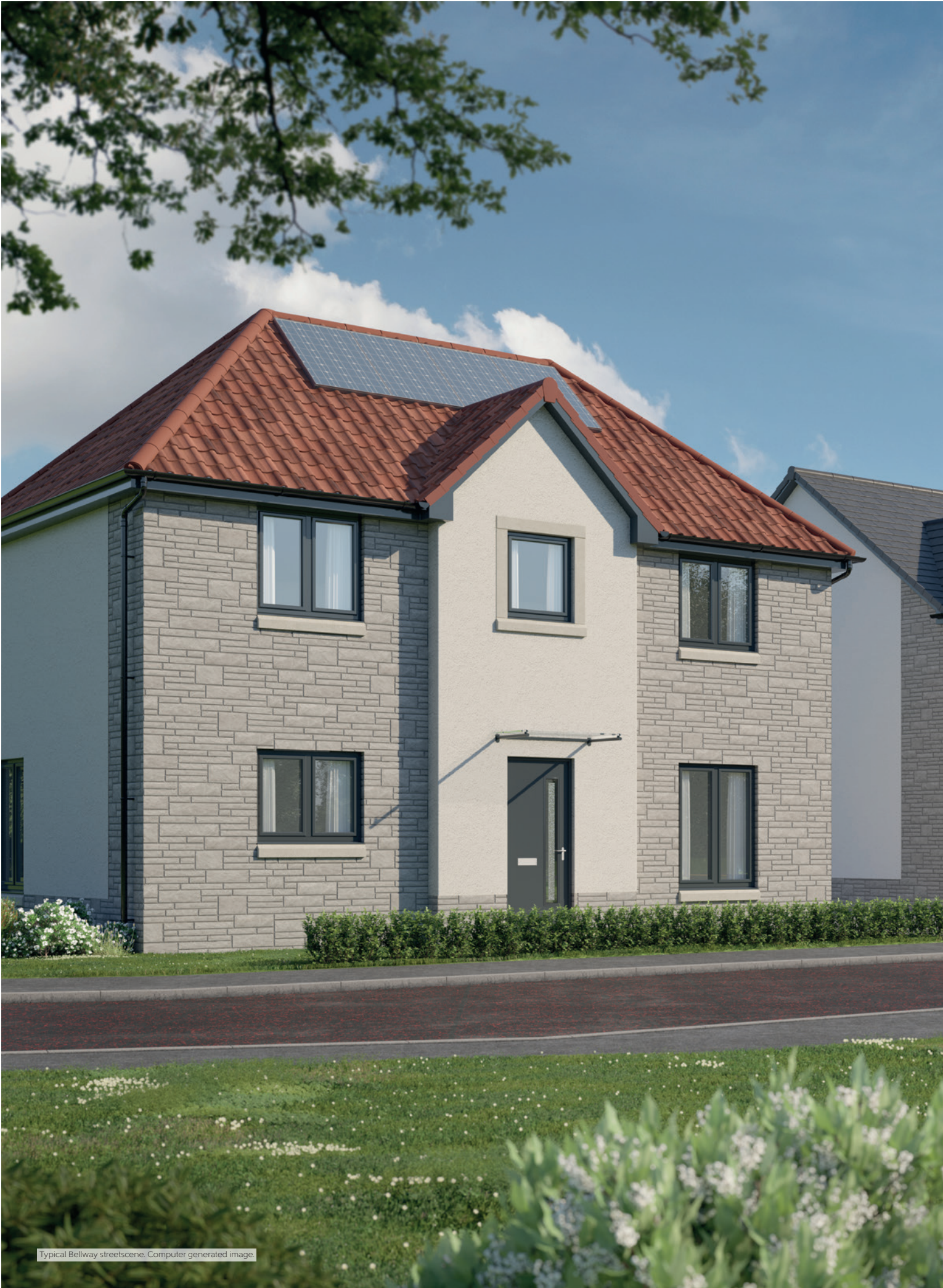
Typical Bellway streetscene. Computer generated image.