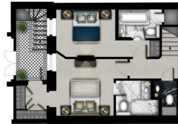
COURT YARD LEVEL