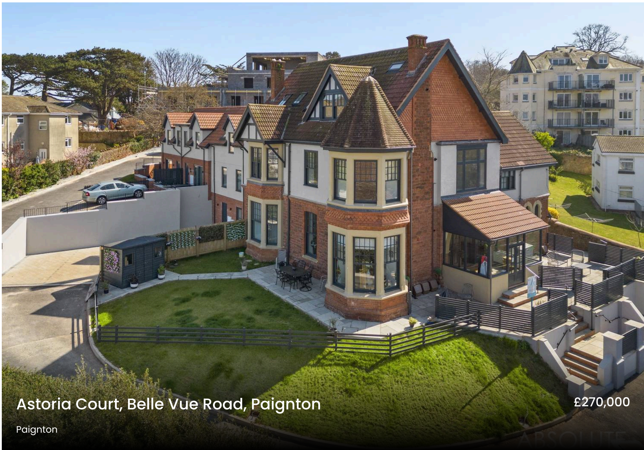
Astoria Court, Belle Vue Road, Paignton