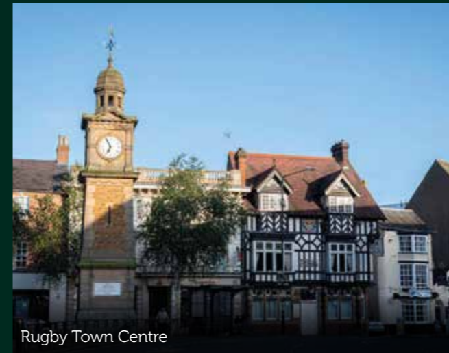
Rugby Town Centre