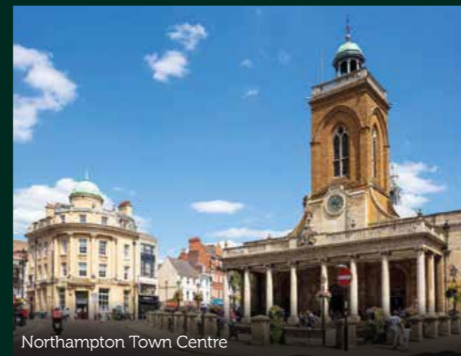
Northampton Town Centre