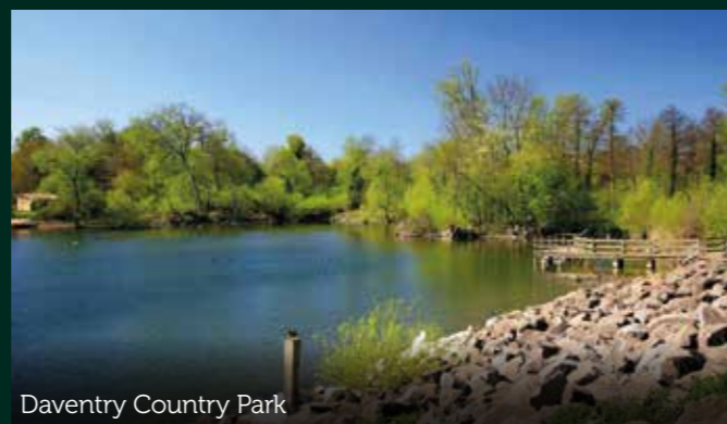
Daventry Country Park

There is also a selection of local schools that all sit within minutes of your door, ranging from primary right through to Sixth Form. With all this close by, it's easy to see why Micklewell Park makes the ideal home for all the family.