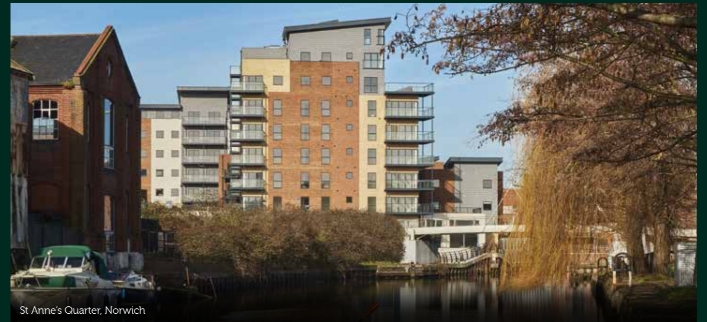
St Anne's Quarter, Norwich

A key objective of Orbit Earth is becoming net zero carbon and our operational carbon footprint has reduced by 21% since 2018-19 with initiatives like investing in lower-carbon tools, switching to 100% renewable electricity for offices and communal areas where feasible, and many more. We continue to explore the potential of new technologies and methods such as off-site modular construction. Orbit Earth is an ongoing process, but it is already benefitting people - not just our residents - and the planet.