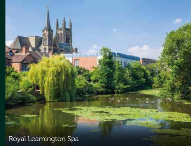
Royal Leamington Spa

International travel is also well catered for too with Birmingham Airport 44 minutes away and Luton Airport around an hour by car; departure points for sun, ski, and city destinations around the globe.