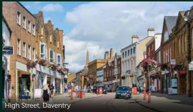
High Street, Daventry

This unique new community is conveniently located on the northern outskirts of Daventry within easy reach of this thriving market town.