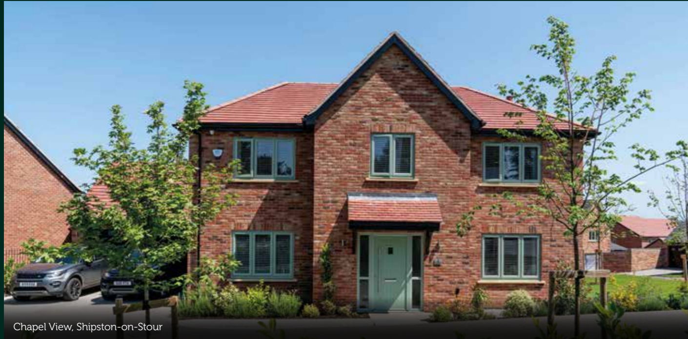
Chapel View, Shipston-on-Stour