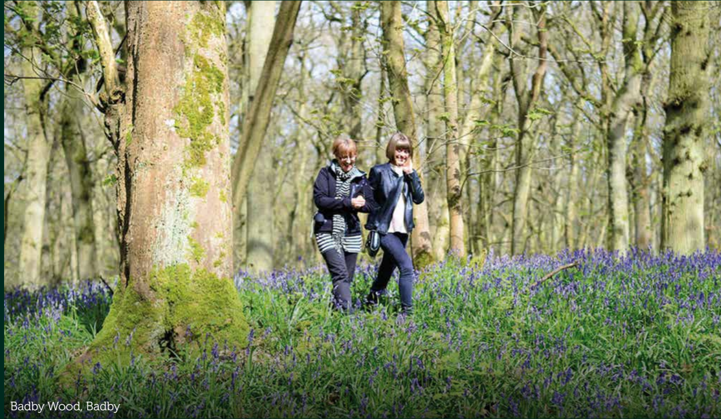
Badby Wood, Badby