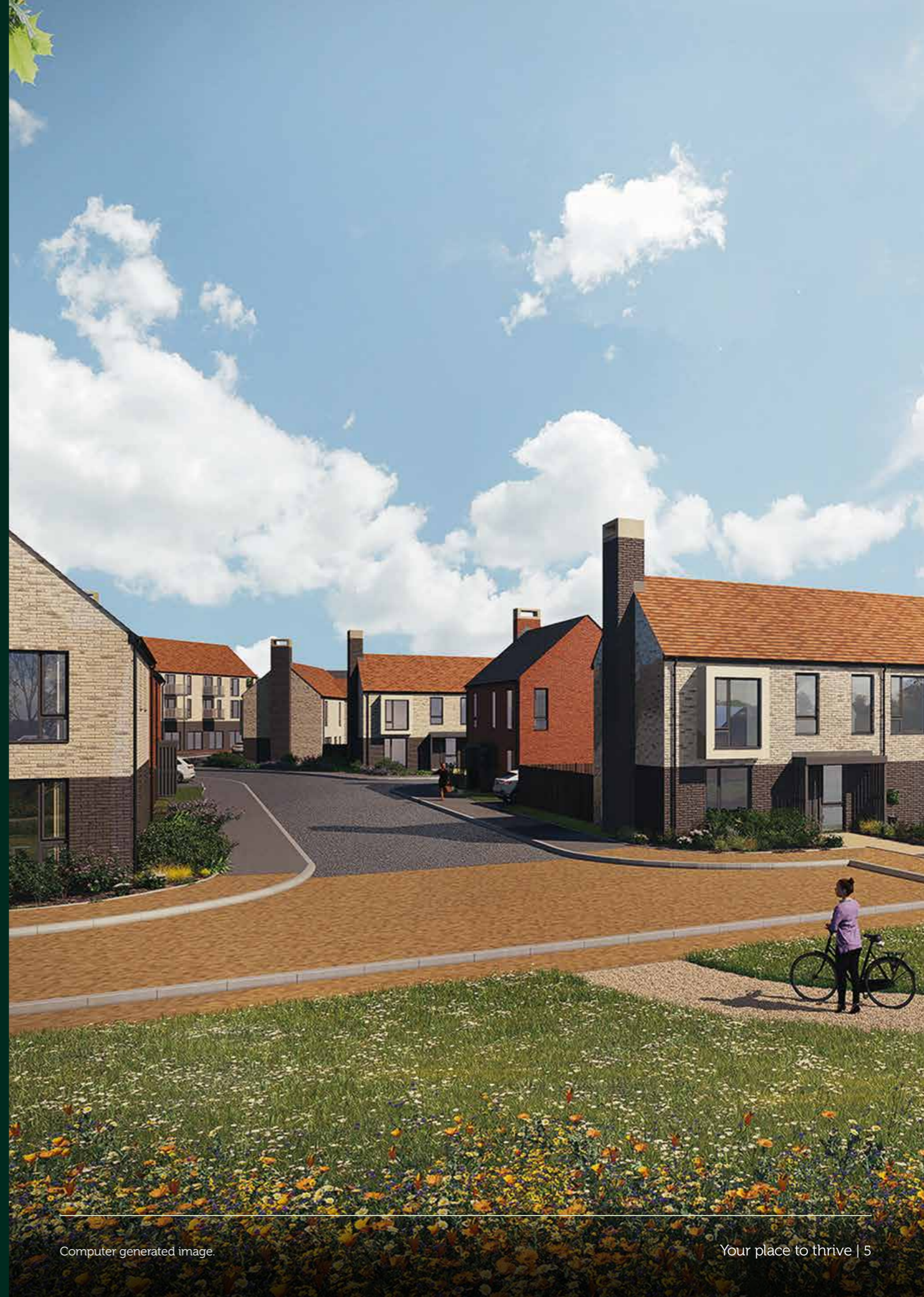
Computer generated image.