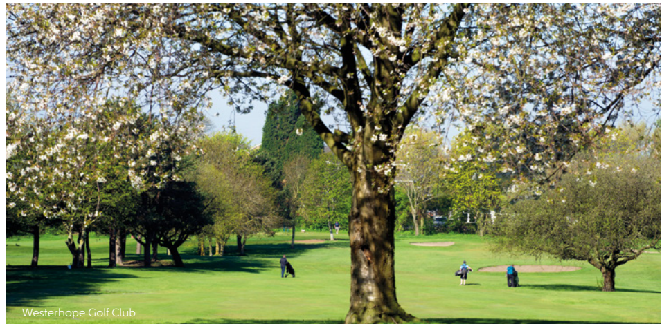
Westerhope Golf Club