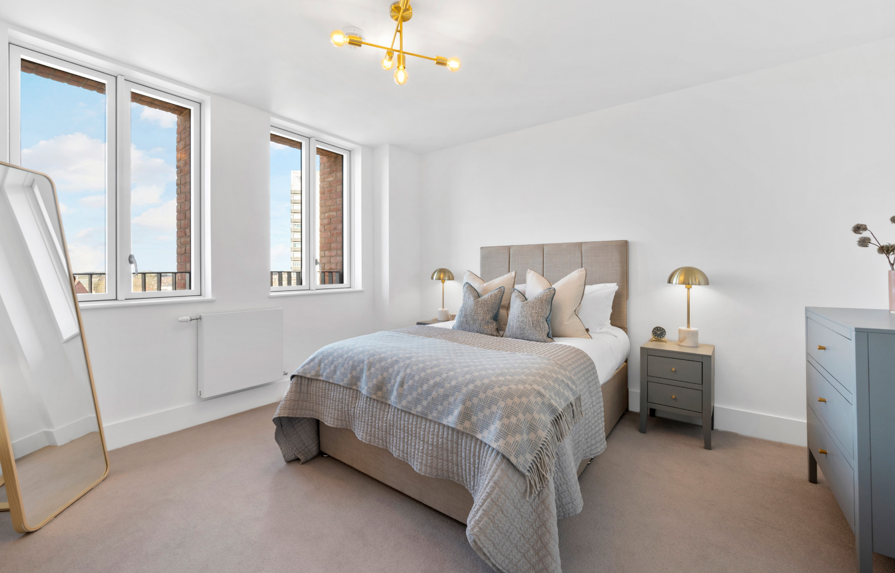
Left The light and spacious second bedroom.