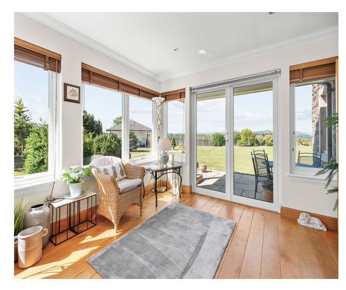
5 Bed | 5 Bath | 540m2