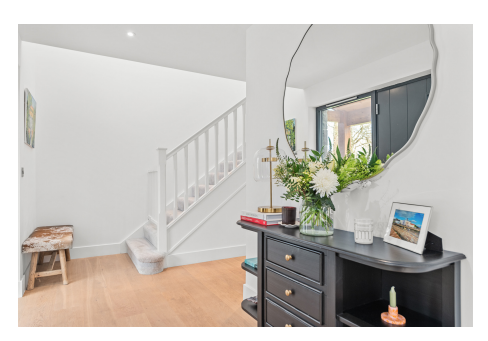
5 Beds | 3 Baths | 296m2