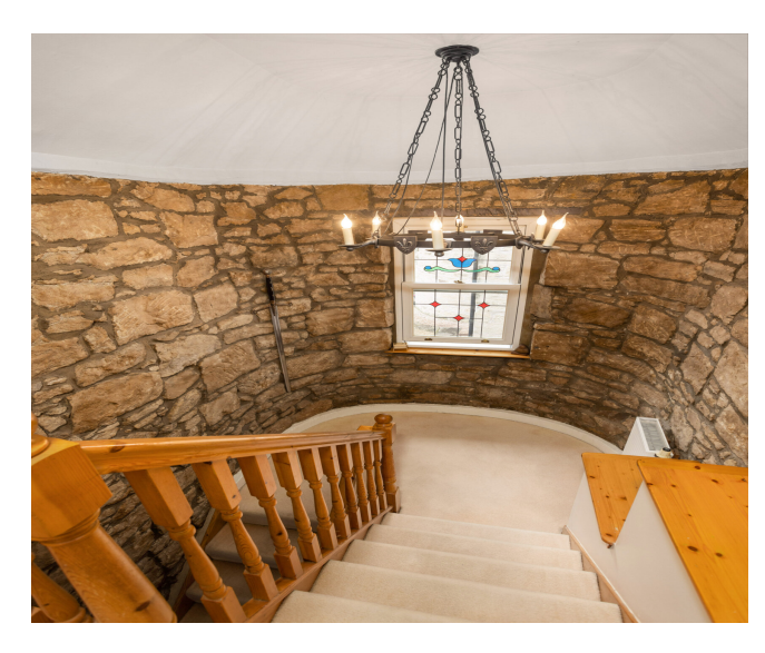
4 BEDS | 2 BATHS | 183m2