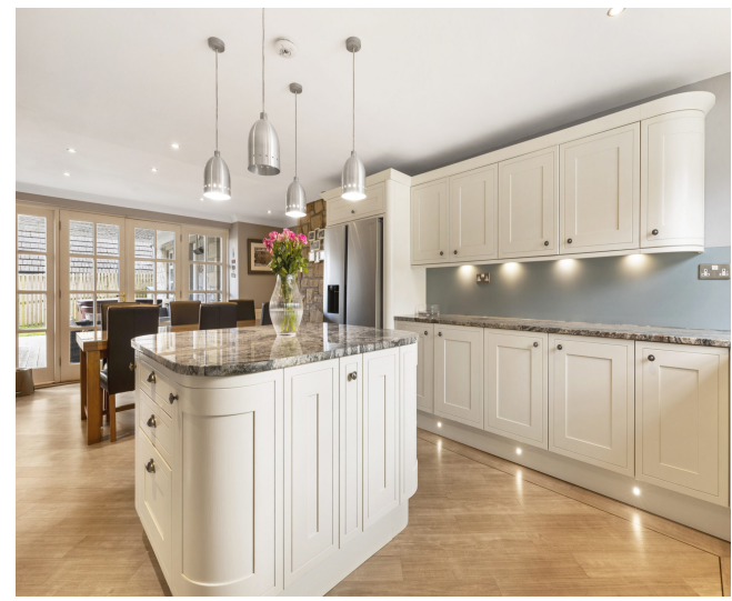
6 Beds | 3 Baths