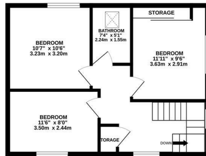
1ST FLOOR 467 sq.ft. (43.4 sq.m.) approx.