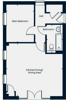
Plots 12, 13 & 14

Kitchen/Living/Dining Area 5.62m x 5.18m | 18'5" x 17'0" Main Bedroom 3.72m x 2.78m | 12'2" x 9'1" Total Area 538 sq. ft.