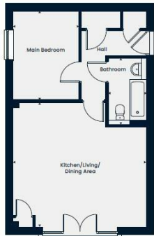
Plots 15, 16 & 17

Kitchen/Living/Dining Area 5.62m x 5.18m | 18'5" x 17'0" Main Bedroom 3.72m x 2.78m | 12'2" x 9'1" Total Area 538 sq. ft.