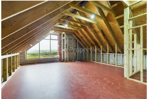
Bankburn, St. Margarets Hope, Orkney, KW17 2TG