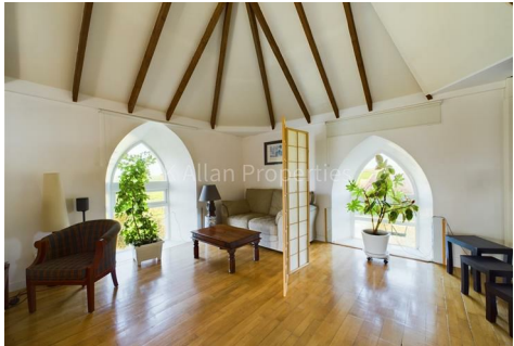
Eastward House and Cressex Lodge, St. Margarets Hope, Orkney, KW17 Offers Over £495,000

K Allan Properties are delighted to present this remarkable estate to the market. Cressex Lodge and Eastward House is situated on the outskirts of St Margarets Hope, just a seven-minute drive from the Pentland Ferry berthing port with regular access to the mainland. The village has two restaurants with food service, a bar, a local produce café and two convenience shops including a post office (with a cash facility). There is also a community garden, blacksmith, museum, art gallery, and craft shop.