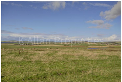
Stoneyhill Road, Harray, Orkney, KW17 2JS Offers In The Region Of £70,000

K Allan Properties are delighted to bring this spectacular building plot to the market. The plot has stunning, panoramic views towards the Harray Loch, along with the Hoy hills in the distance. The plot measures approx. 1440 meters.