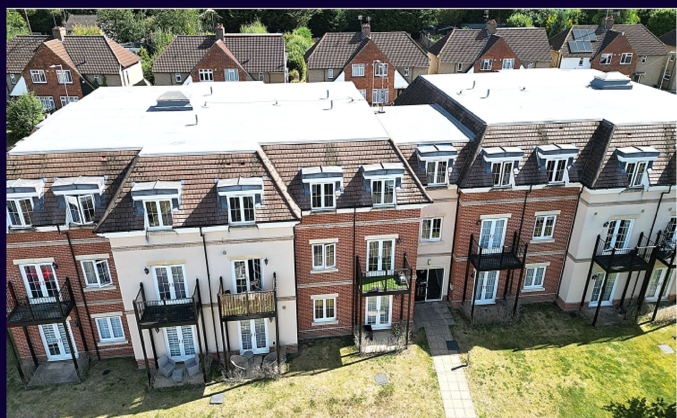
Navarre Court 10 Primrose Hill, Kings Langley, Hertfordshire, WD4 8FS