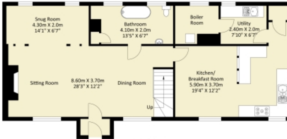
Ground Floor Approximate Floor Area 857 sq. ft (80.0 sq.m)