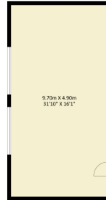
Outbuilding Approximate Floor Area 512 sq. ft (48.0 sq.m)

Approximate Gross Internal Area = 204 sq m / 2196 sq ft Illustration for identification purposes only, measurements are approximate, not to scale.