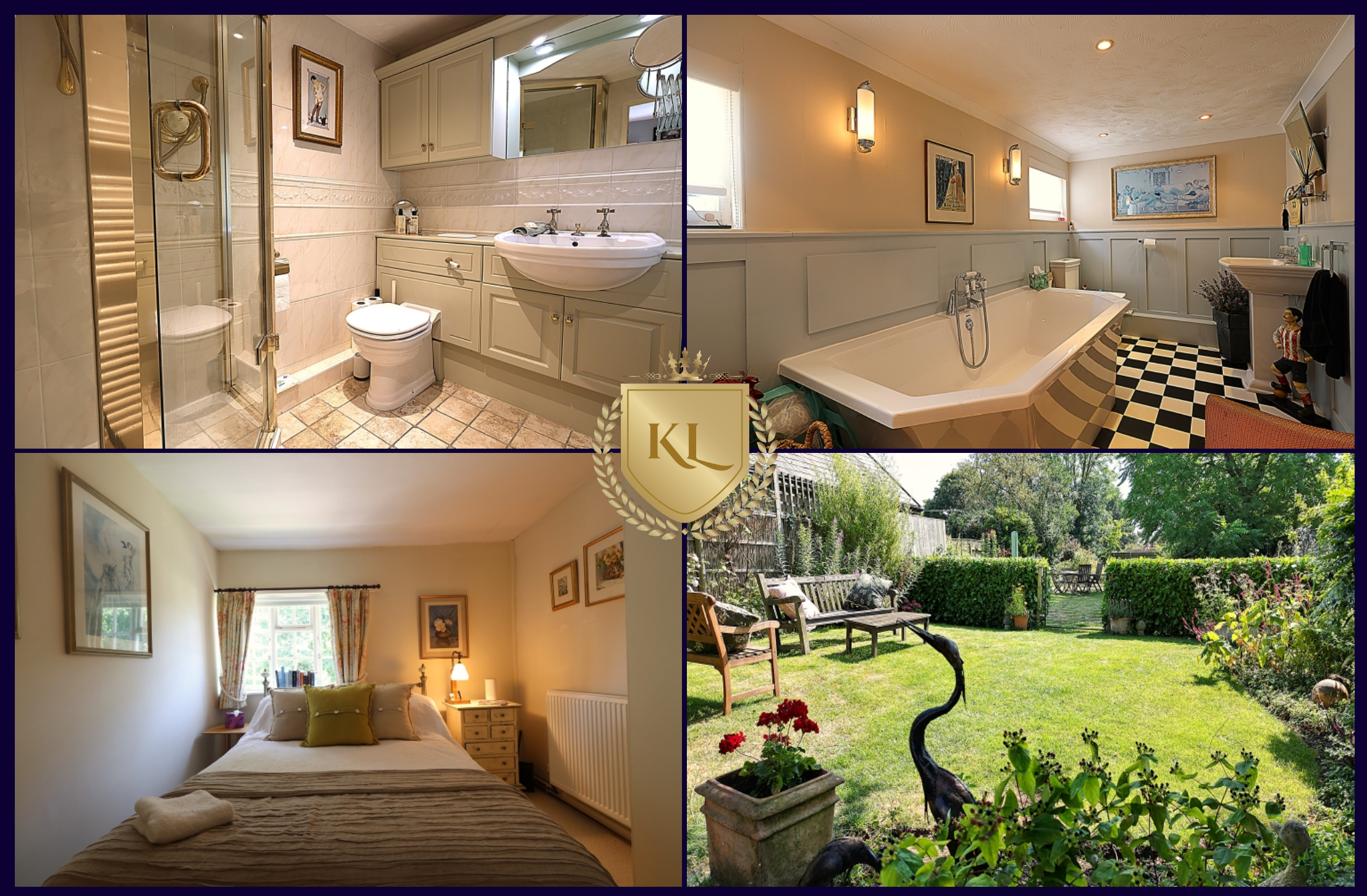
Kings Langley Estates wishes to inform prospective buyers and tenants that these particulars are a guide and act as information only. All our details are given in good faith and believed to be correct at the time of printing but they don't form part of an offer or contract. No employee of the company has authority to make or give and representation or warranty in relation to this property. All fixtures and fittings, whether fitted or not are deemed removable by the vendor unless stated otherwise and room sizes are measured between internal wall surfaces, including furnishings.