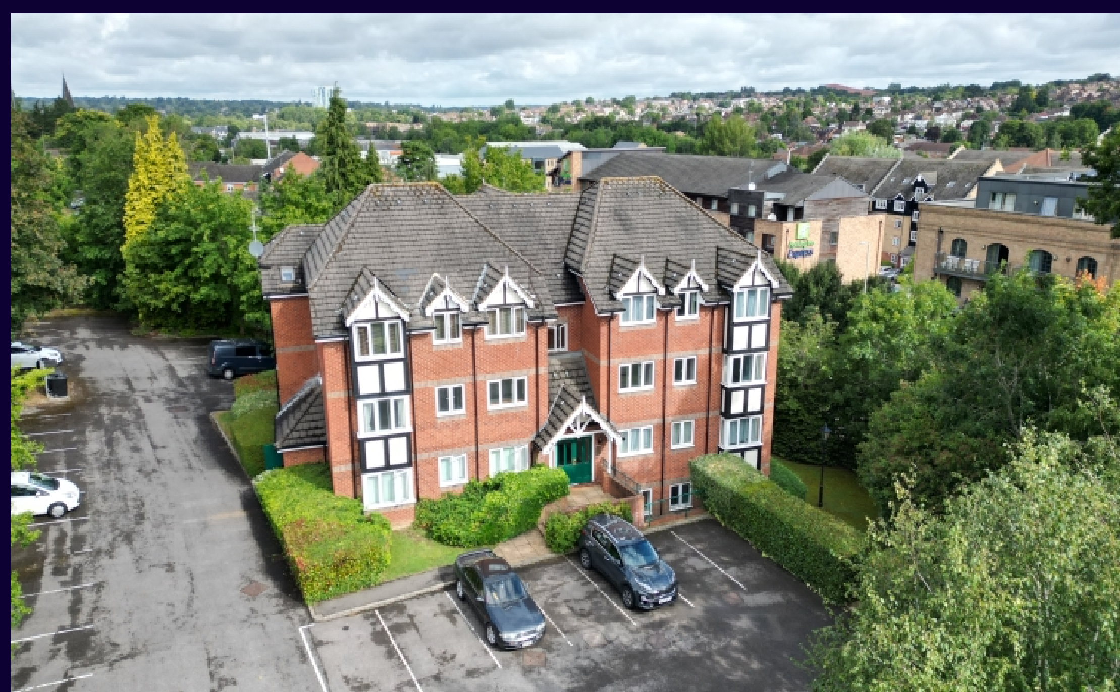
Cavendish Court London Road, Hemel Hempstead, Hertfordshire, HP3 9FH