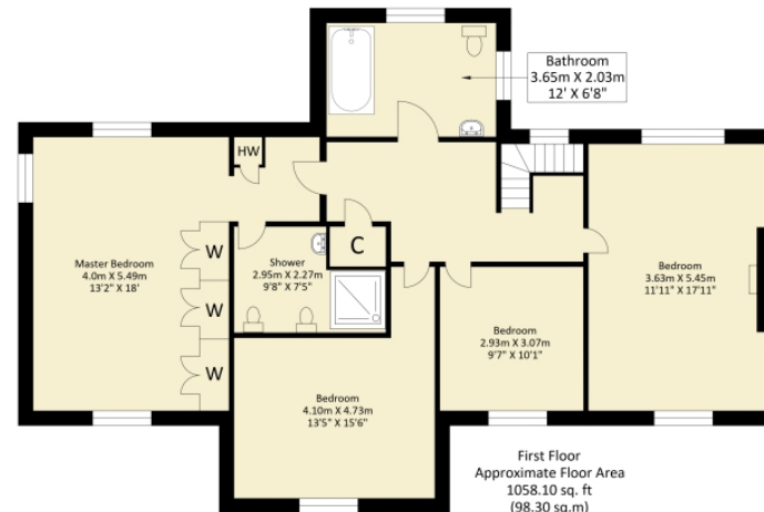
First Floor Approximate Floor Area 1058.10 sq. ft (98.30 sq.m)

Approximate Gross Internal Area = 191.90 sq m / 2065.60 sq ft